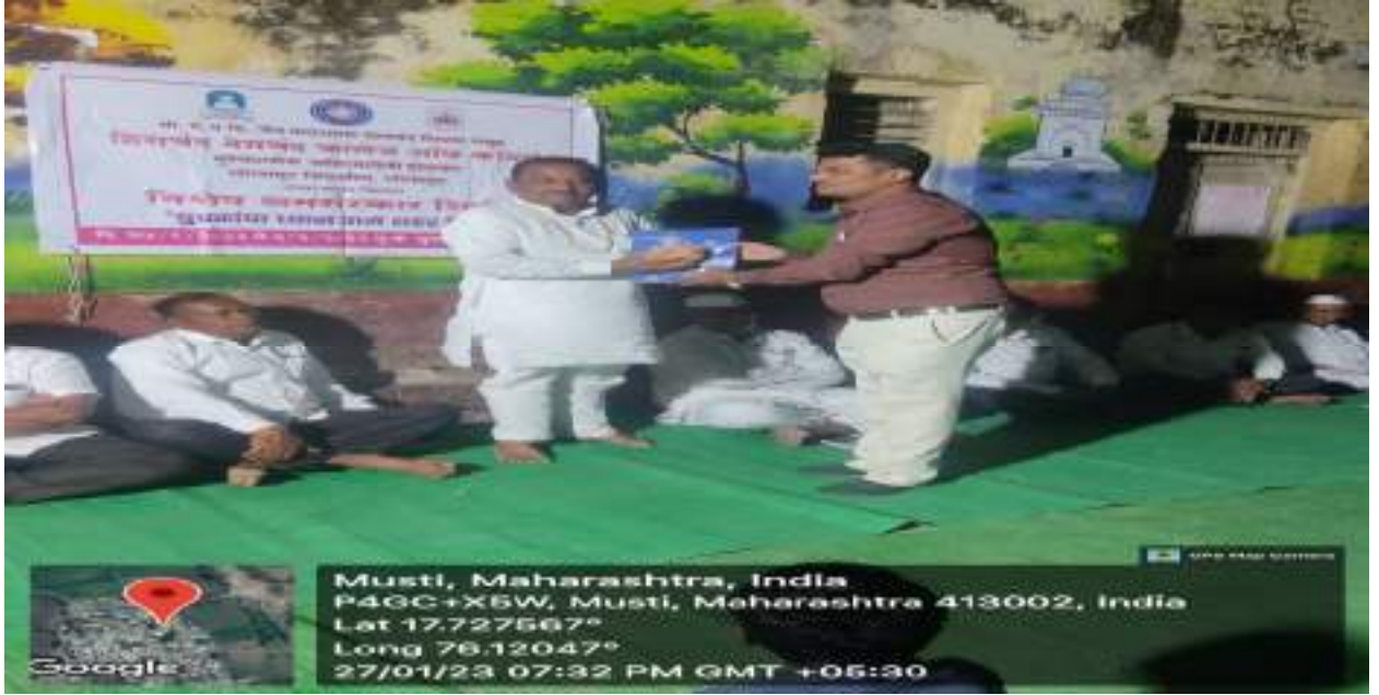
37) 27 Feb to 3 rd March 2023: NSS Annual Residential Camp at Musti Village Dist: Solapur NSS Annual Residential Camp was successfully completed at Musti Village. Several social activities were conducted like cleanliness, voter awareness, women empowerment, youth leadership development. 21 Students participated in this camp. (Detail Report is there)