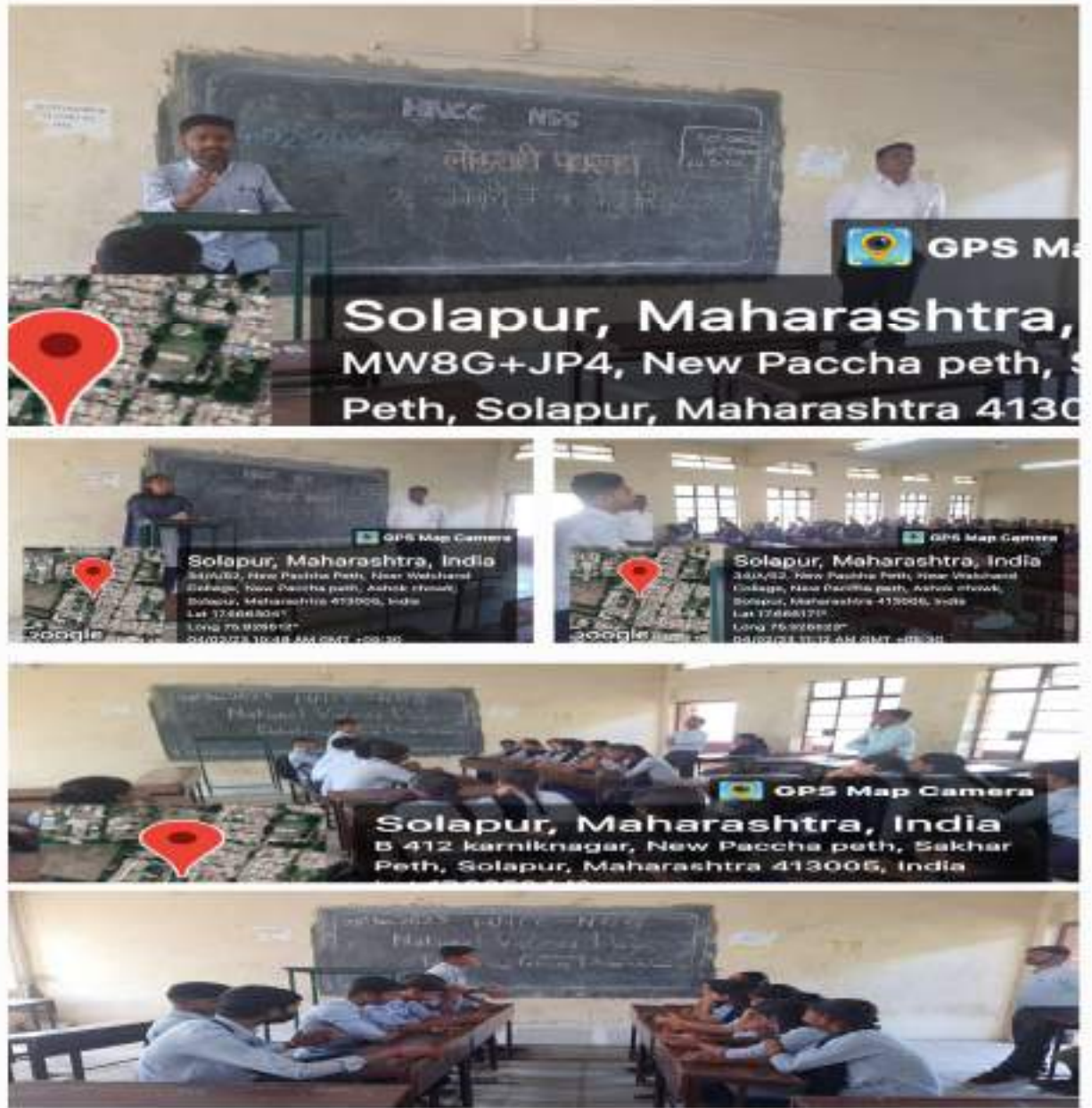
36) 25 th January to 10 th February 2023 : Lokshi Fornight and National Voters Day Various competitions were organized like easy and group discussions to promote and motivate the students to vote and promote other to vote for a better democracy and good governance. 71 Girls and 30 Boys for the time period.