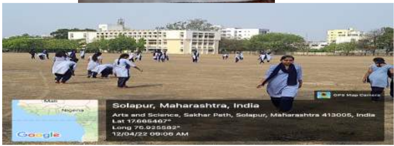
1) 12 th April 2022: College Campus Cleanliness Activity/Drive 65 students have participated in this College Campus Cleanliness activity. NSS volunteers cleaned college ground. 42 Girls and 23 Boys.