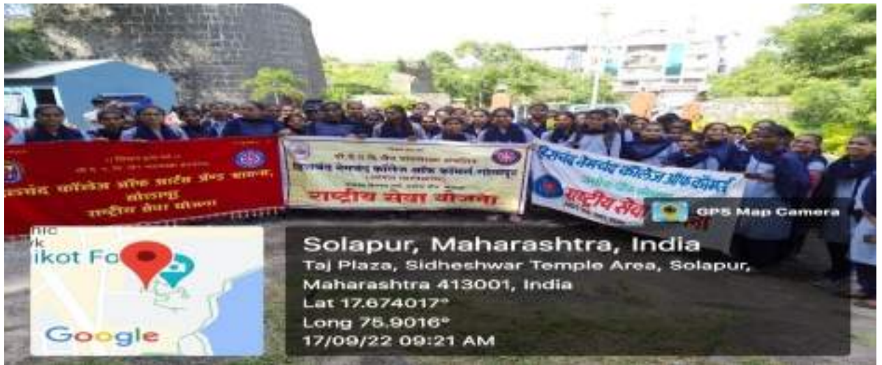
21) 17 th September 2022 Swachatta Amrit Mahotsav: In association with Solapur Municipal Corporation 62 students participated in this activity at Bhukot Killa (Fort) Solapur. 44 Girls and 18 Boys.