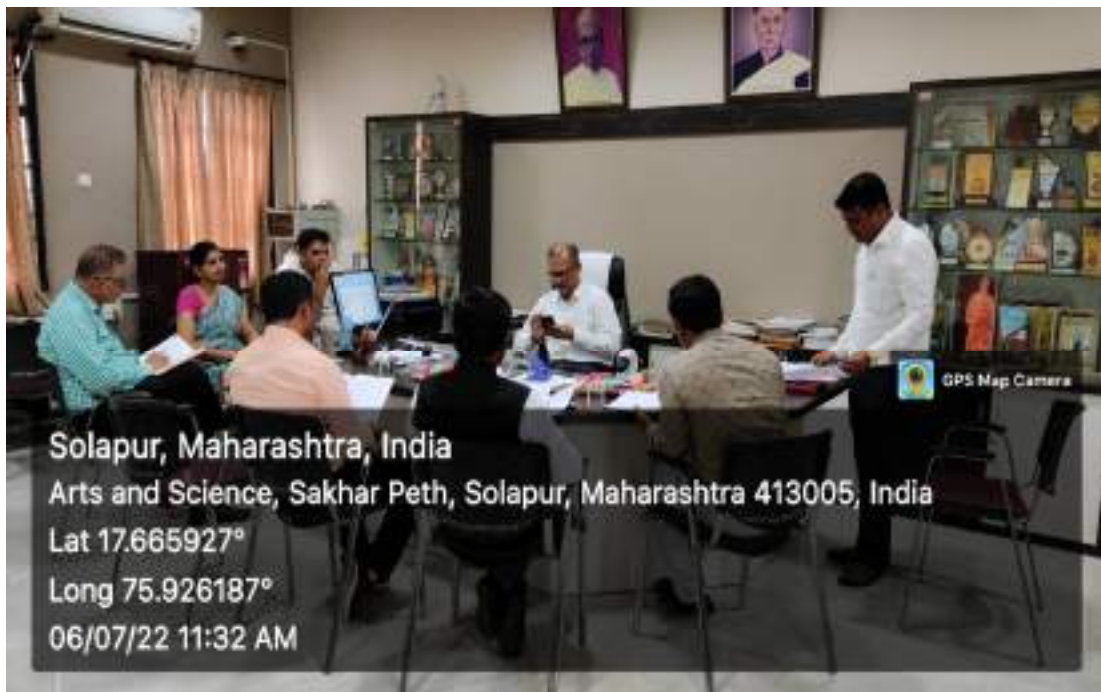
10) NSS Advisory Committee meeting : 6 th July 2022, with Director, District Coordinator and Regional Coordinator NSS Dept. P.A.H Solapur University, Solapur, and College NSS Committee.