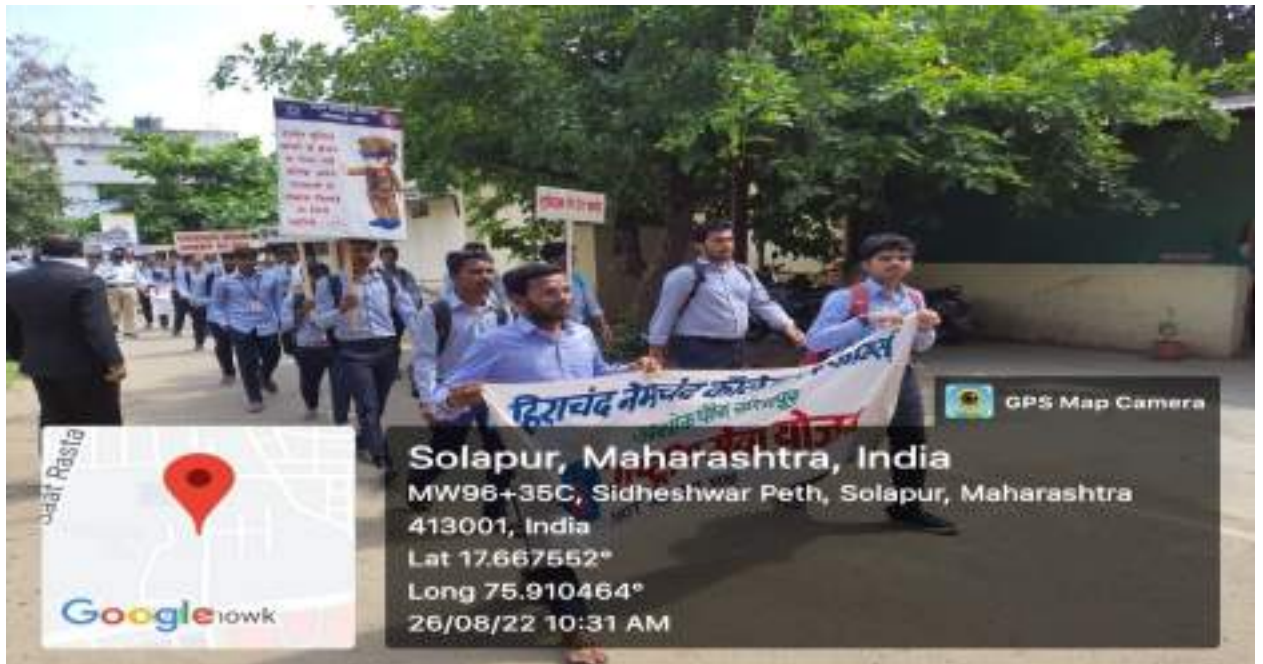
19) 26 th August 2022: Rally – Road Safety

This rally was organized by Solapur District Legal Services Authority and Solapur RTO Office. 30 Students participated in this rally. 18 Girls and 12 Boys.