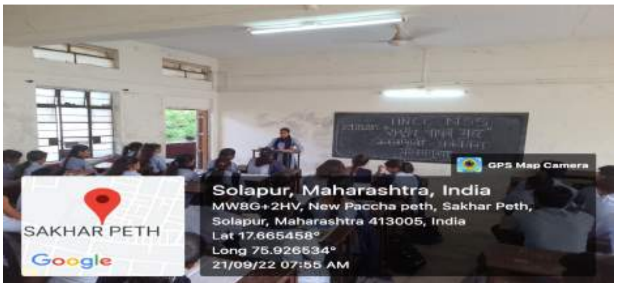
20) 17 th Sept 2022: Rashtriya Poshan Mah Celebration

This rally was organized by Solapur District Legal Services Authority and Solapur RTO Office. 30 Students participated in this rally. 18 Girls and 12 Boys.